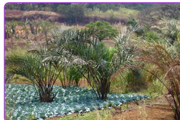
Destruction of wet land for agriculture in West Cameroon