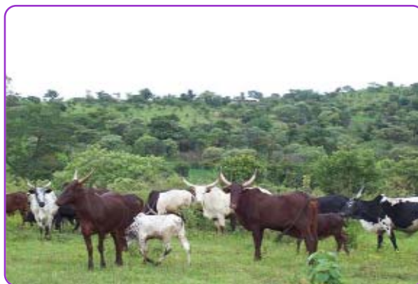
Animal rearing in Adamaoua province