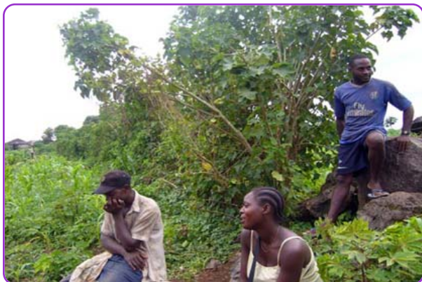
Jathropha fence in Cameroon

N/B: details of presentation topics in each work group shall be provided later