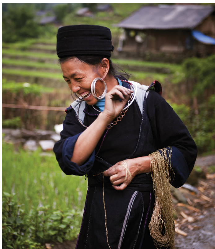
From top left, clockwise: More bread, more jobs. “I wish I could walk around without being hurt by inappropriate words.” ; Hmong Woman in Viet Nam: A Hmong hill tribe woman at work in Sin Chai, Viet Nam. Women enjoy playing soccer at a city park in Kolkata, India.