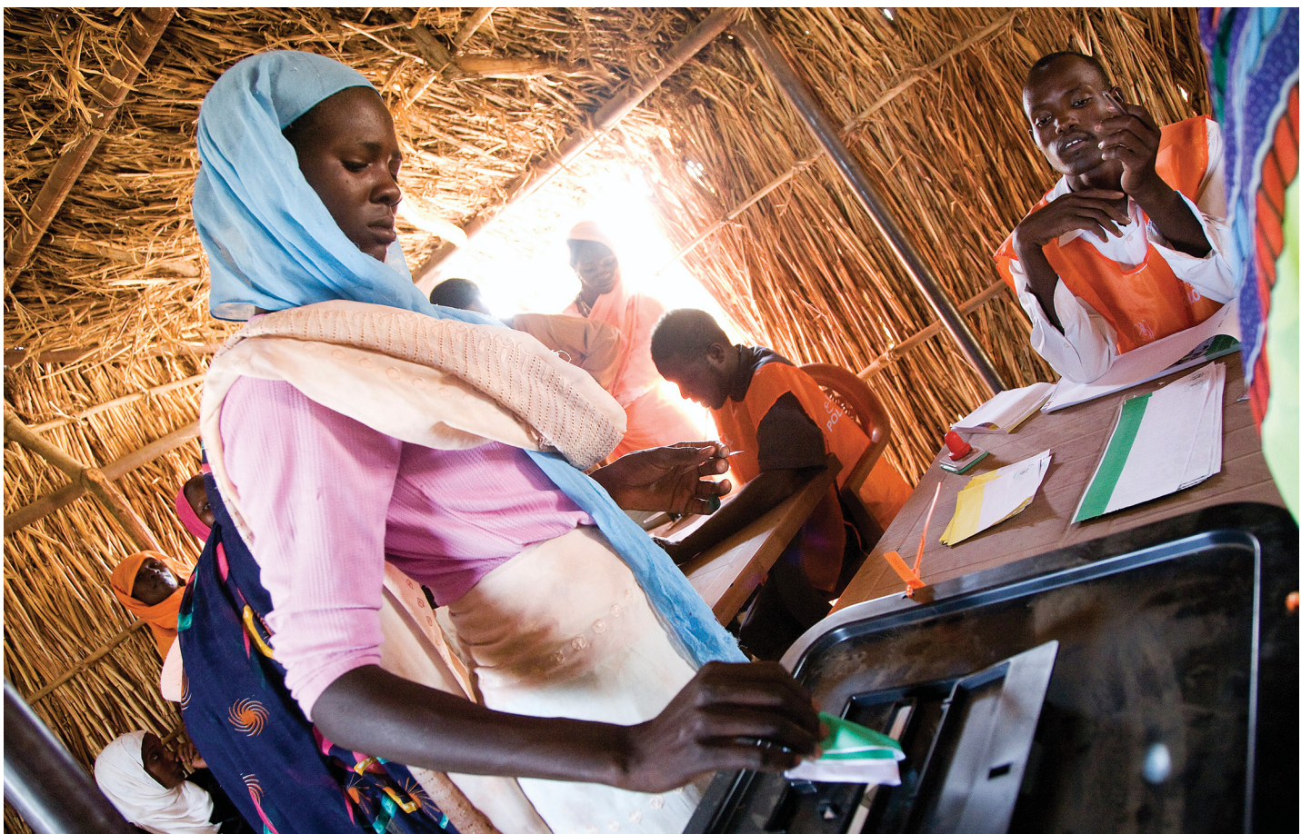
From top: Young woman from a fishing community in West Bengal in eastern India.; North Darfur Woman votes in Sudanese national elections..