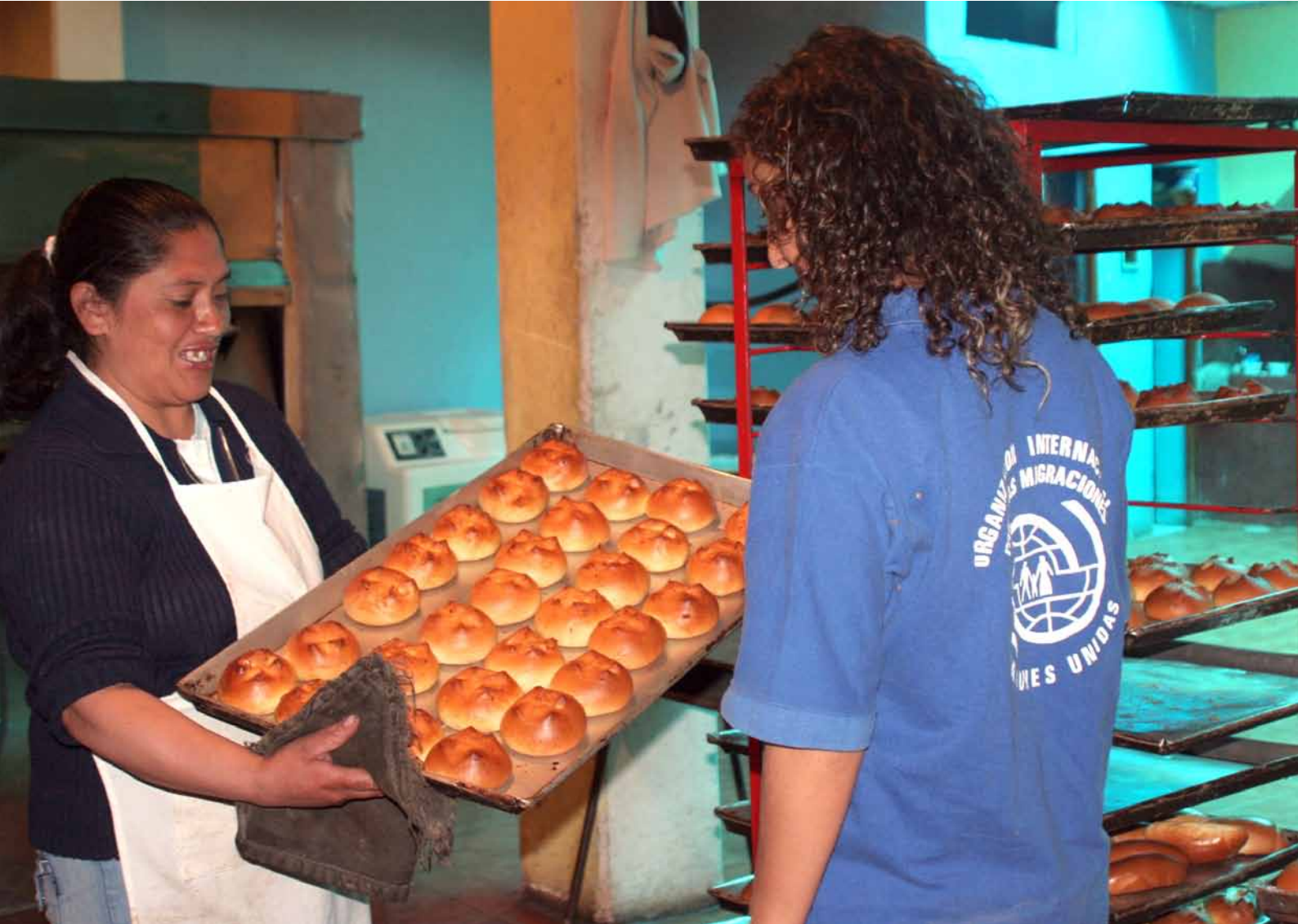
A temporary migrant worker in her bakery in Nariño, Colombia, a business she established thanks to the savings generated during her visit to Spain through IOM’s Temporary and Circular Labour Migration Programme.

To effectively intervene in emergency and post-crisis situations, IOM has developed a comprehensive framework with the overall objective of ending displacement through the provision of durable solutions and the creation of an environment conducive to sustainable development. The framework can be seen